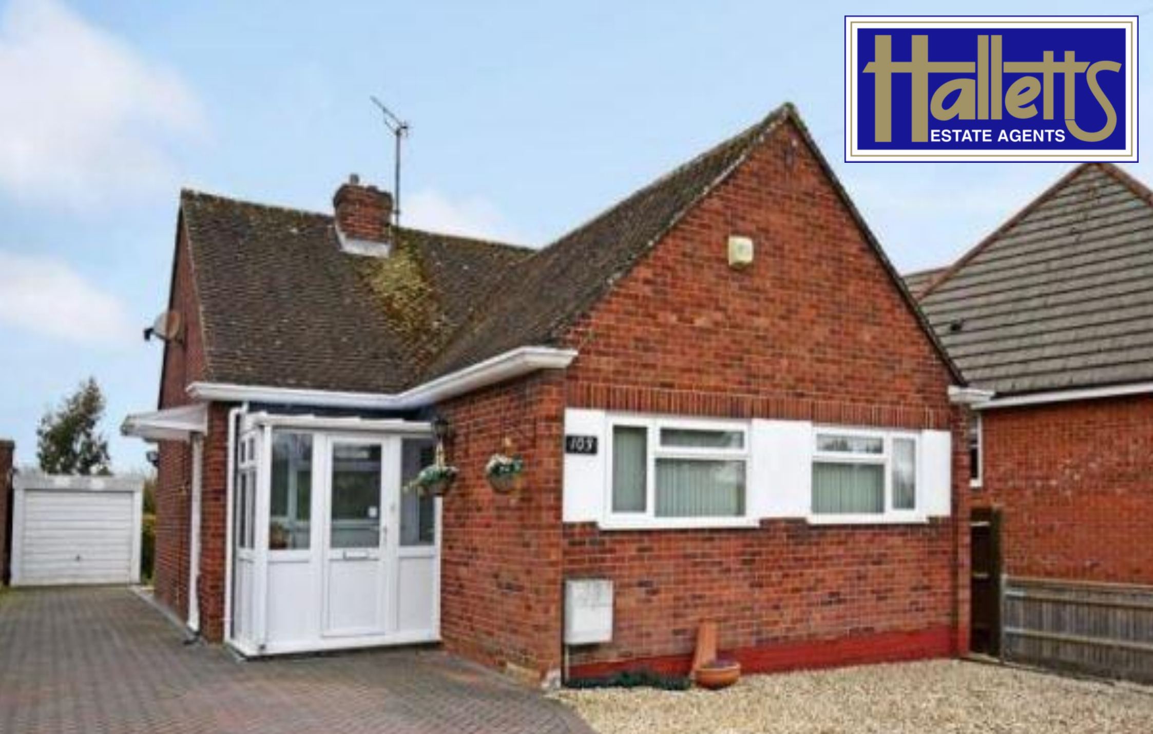
103 Newtown Road Newbury Berkshire RG14 7EA